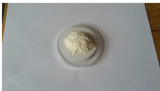
Figure 3. A sample of the collagen hydrolyzate after drying.

The hydrolyzate of protein raw material after pasteurization and drying can be used both as a highly digestible protein supplement for piglets and as a protein base of a nutrient medium for cultivation of probiotic bacteria [16-19].