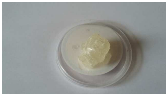
Figure 2. A sample of the collagen hydrolyzate prior to drying.

In the feed industry, collagen additives can be used to produce granulated and extruded feeds in order to increase their biological value and the strength of the pellets. A sample of the hydrolyzate before and after drying is shown in Figure 2, 3.