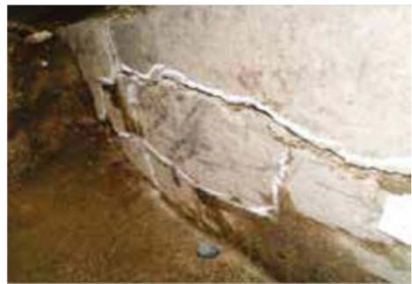
Figure 9. Low shoes with cracks in maps marked with chalk [27].