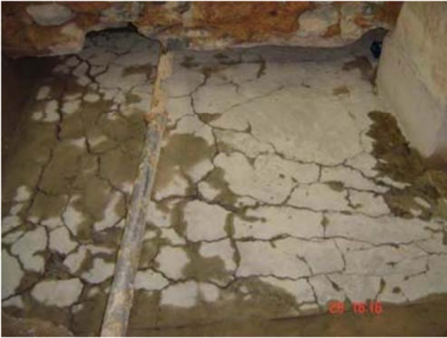
Figure 5. Block fissure with 18 stakes, with dimensions 8 x 6m [25].

In the analyzes it was observed that in some cases, besides the vertical cracks in the blocks on two stakes have exceeded the connecting rods, in two cases, at the bottom of the building, the AAR weakened the blocks to such an extent that there were redistribution of loads to other blocks.