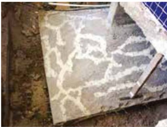
Figure 11. Cracks and fissures clogging [27].