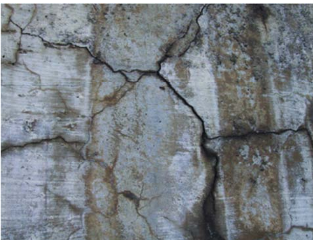
Figure 3. Crack in the shape of a map in the foundation block of the Paulo Guerra Bridge [26].