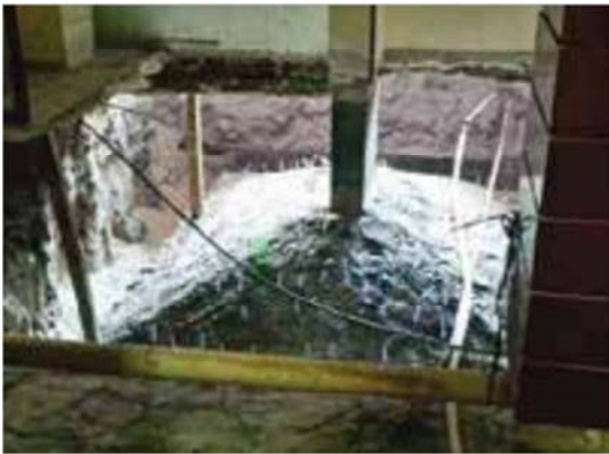
Figure 10. Low shoe bleeders [27].

The recovery service was incomplete because, at the end of the shoe encapsulation, these were not waterproofed, which may facilitate the penetration of aggressive external agents and moisture. The method described in this work is the most widely used and known to the present moment for recovery of alkali-aggregate reaction, but it is not totally effective. The proof of this, is that some shoes that had already been recovered previously but, after a few years, returned to present the fissures [27].