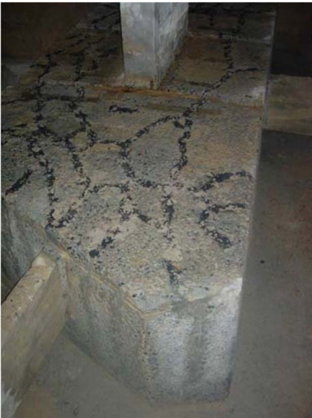
Figure 8. Foundation block with cracks already filled [25].

that in the year 1983, three years after its construction, the work had already presented fissures in some blocks, being reinforced the ones. However in 2008 it was found that some blocks which had not been reinforced in 1983, now presented many fissures in the lateral and upper faces, with similar aspect to those of several buildings in which the existence of AAR was already established in the metropolitan area of Recife. Figure 7 shows the cracks in the foundation block already filled with microcement [25].