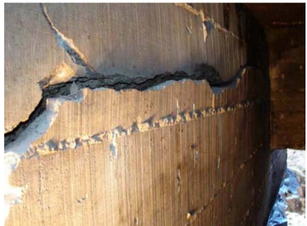
Figure 7. Horizontal crack with large opening and displacement [25].