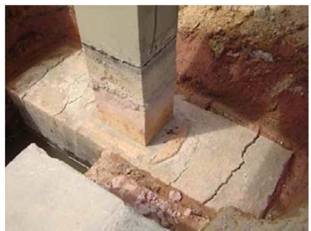
Figure 4. Fissure in block on two stakes, with dimensions 1 x 2,5m [25].

It is written that after the rupture occurred in the Areia Branca Building and with the evidence of similar occurrences in the foundations of other buildings in the city of Recife, it was decided to inspect the foundations of the mentioned building. In the study, a very severe cracking picture was observed, both by the number of cracks and by the magnitude of its openings. Figures 3 and 4 present the pathological condition of the foundation blocks of the building [25].