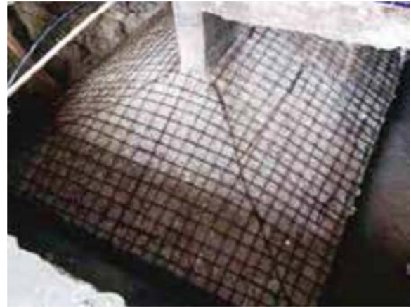
Figure 12. Steel mesh for shoe encapsulation [27].