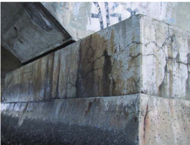
Figure 2. Signs of AAR in the central span support block of the Paulo Guerra Bridge [26].

The fissures were predominantly in the blocks themselves, but they could also be seen in the calyxes and the pre-welded plates that cover the calyxes and their bases (Figure 2). This framework of cracking in concrete pieces is characteristic of the occurrence of alkali-aggregate [25].