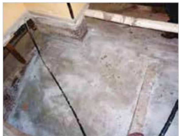
Figure 13. Concreted shoe [27].