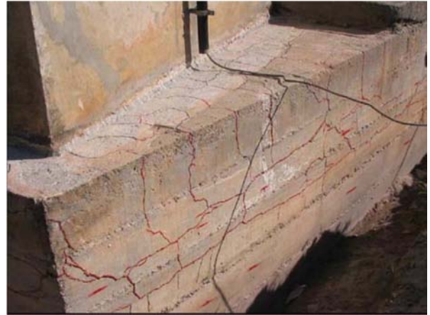
Figure 6. Upper and lateral block faces with cracks painted [25].

Considering the table presented and the analysis of the tests carried out, there is no doubt about the strong existence of AAR in the foundation blocks, being evidenced a high expansion in the blocks due to the favorable conditions to its development as the presence of reactive aggregate, alkalis and humidity.