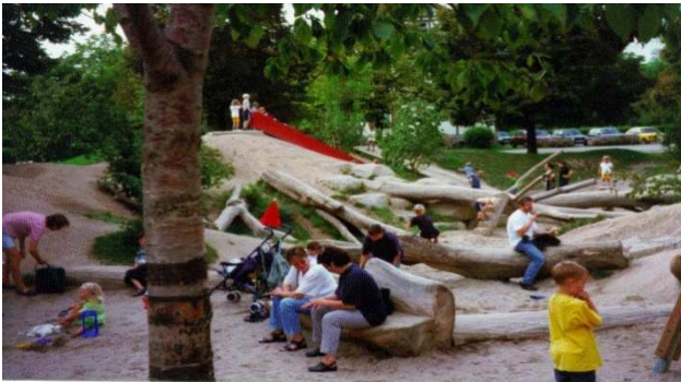
Figure 3. A transformed playground in Freiburg.

The cost of building such play spaces has been estimated by Freiburg City Council as 50% less than the cost of building conventional playgrounds, while the maintenance costs are about the same.