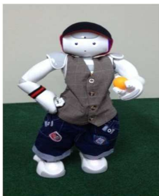
Figure 15. the NAO (NIMA) Robot.

First educational robots applications were in Canada, Taiwan, South Korea, Japan and United States. For example, there are: Japan's Robovie as a peer tutor for teaching English at elementary school, Paperno(2004)for child- care, Keepon(2007) as an collaboration inducer for children suffering from autism, Saya(2010)for utilization in Japanese preschools; Iroobi (2005) as a teaching assistant preschool, Irobioiq(2008) for use in primary school English teaching, Robosem(2011) as an English teaching assistant; Robosapien(2006) as Taiwan's elementary teaching assistant; Rubi was used in the United States preschool peer tutor and Vgo(2011) for young patients; Nima (2013)used in Iran' junior high schools as a teacher assistant.