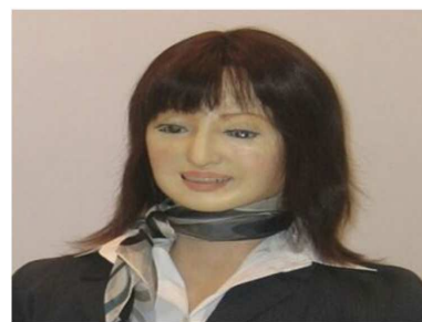
Figure 3. Saya (a robot teacher in Korea).