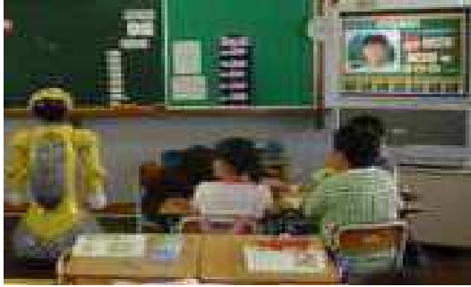
Figure 9. Getting Attention.

Tiro's services contained children's photo and names. Its other services also are divided into two kinds: 1. Class management, such as calling the roll, getting attention, selecting presenter and acting as a timer. 2. Learning materials which are transmitted to TV, such as lesson objectives, storytelling, conversation scripts, dancing, English chants, role playing, cheering up and praising, providing quiz games.