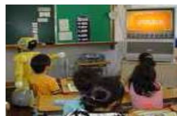
Figure 8. Calling the Roll.