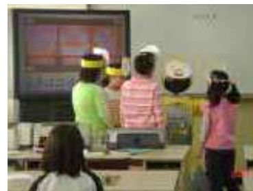
Figure 7. Conversation