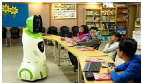
Figure 2. A robot teacher teaching students.