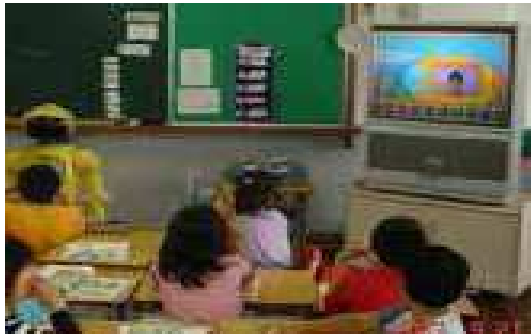
Figure 10. Selecting Children to Present.

Tiro's services contained children's photo and names. Its other services also are divided into two kinds: 1. Class management, such as calling the roll, getting attention, selecting presenter and acting as a timer. 2. Learning materials which are transmitted to TV, such as lesson objectives, storytelling, conversation scripts, dancing, English chants, role playing, cheering up and praising, providing quiz games.