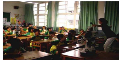
Figure 13. Teacher telling a story with a robot.