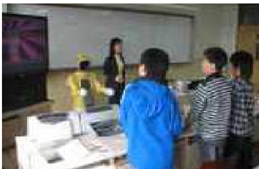
Figure 11. English Chant and Dance.

They also do activities like supporting English learning, playing music, reading books, guiding daily activities (e.g., eating, cleaning), collecting and compiling children's academic portfolios and photos and then transmitting them to learners' parents via e-mail or mobile phone, singing a lullaby, teaching general eating etiquette such as washing hands.