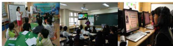
Figure 1. A traditional collaborative class, a video conferencing class, and a one-on-one conference in Korea. (Language Learning & Technology http://lt.msu.edu/issues/october2012/emerging.pdf )

tremendous, but it is costly for students and no help is available in the students' mother tongue.