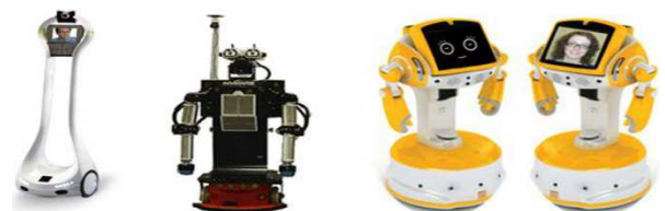
Figure 14. VGO is tele-operated (left), ROBOVIE is autonomous (center) and ROBOSEM is transformed (right).

Educational service robots are divided into three types: the tele-operated, autonomous, and transformed types which are categorized according to the location of their artificial intelligence. 1. Tele-operated type: it supplies the tele-presence of instructional services through a remote controller that the instructor uses. 2. Autonomous type: it has its own created artificial intelligence. 3. Transformed type: it has both autonomous and tele-operation control and can switch between these two operations.