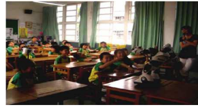
Figure 12. Students giving the robot commands.

They also do activities like supporting English learning, playing music, reading books, guiding daily activities (e.g., eating, cleaning), collecting and compiling children's academic portfolios and photos and then transmitting them to learners' parents via e-mail or mobile phone, singing a lullaby, teaching general eating etiquette such as washing hands.