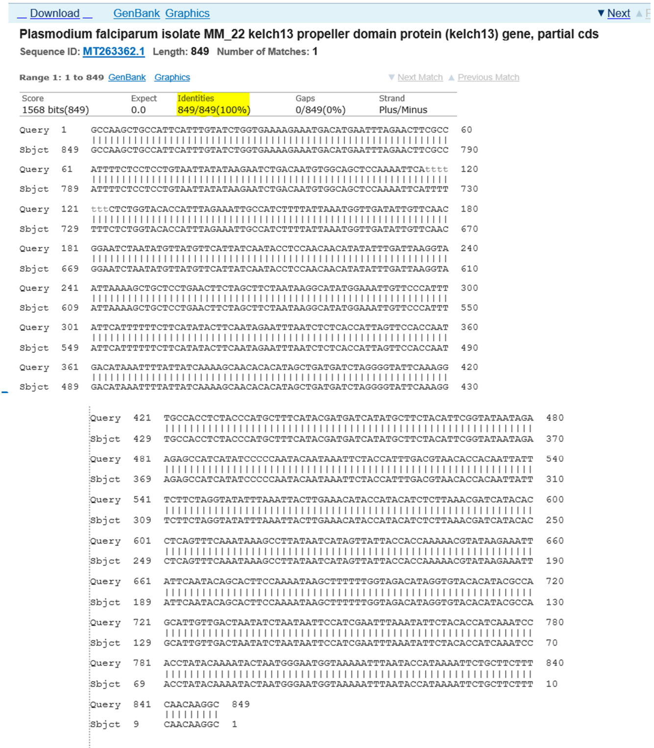
Figure 3. BLAST result of K13 Propeller gene of Plasmodium falciparum .