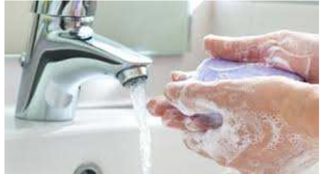
Figure 1. Wash hands with soap and water

the population of each country times the number of quarantine days.