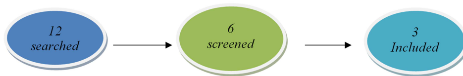
Figure 2. Study selection process.

for further screening. After duplicates were removed, 6 studies have screened as relevant and examined the abstracts, retrieving the full text, examining the full text to determine eligibility and finally, 3 studies decided to be included and reviewed thoroughly.