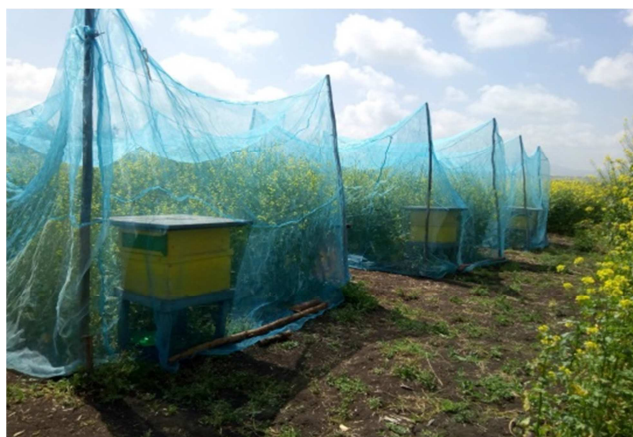
Figure 2. The treatment caged with honeybee, caged without honeybee and Open pollination.

The dependent of B. carinata seed yield was measured with comparing seed yield/ ha from the seed yield from crops with honeybees only, seed yield from crops excluded from crops caged without honeybees and open to all visitors’ flowers. Seed yield advantages increases for all insect pollinators was calculated (%) = ((SYall-SYself)/SYself) x100, seed yield increases from honeybees excluding all other insects (%) = (SYbee-SYall)/ (SYall) x 100, Where SY all represents open pollination/natural for all insect pollinators open (T3), SYself represents excluded from any insect pollinators (T3), SYbee crops caged with honeybees (T1) [18-19].