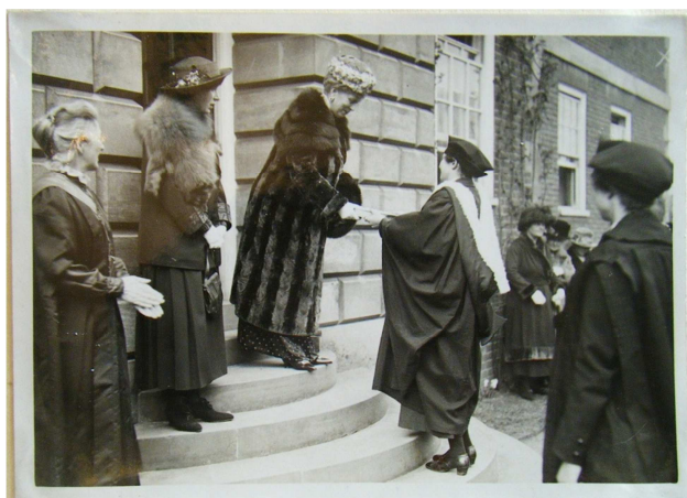
Figure 14. Ceremony, Lady Margaret Hall (1928).

Colourful gowns and hoods were seen at the tea party held after the ceremony. 'Over one thousand, I believe, and gowns and hoods of every gorgeous colour and M.A.s [masters of arts] and B.A.s [bachelors of arts] and undergraduate gowns too, of those just going down.' [48]