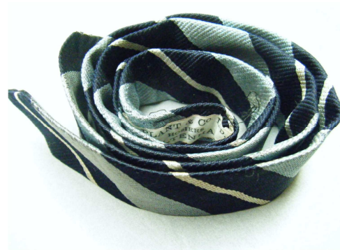
Figure 6. St. Hilda’s College Tie.

The clothing for college girls reflects the environment of this period. It was not a uniform but a combination of skirts and blouses that was in style and was worn by women in general. Clothes for girls were required to be ‘simple and sombre’ and colleges ensured that this is practiced. [17] This