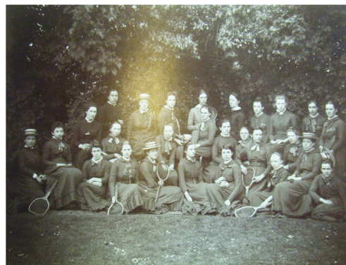
Figure 1. Tennis Team, 1885, Newnham College.