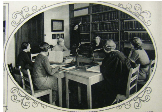
Figure 13. Illustrated London News (1937).

In an article that was published in the Illustrated London News on 6 th November 1937, a student was seen wearing an academic robe during a lecture (Figure 13). In the same article, some college girls were seen wearing academic gowns in rooms, the picture gallery and the library.