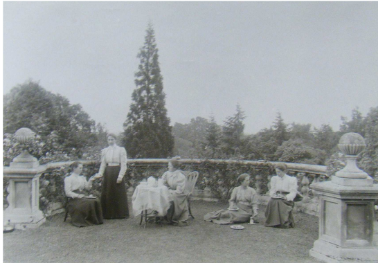
Figure 10. Tea Party, Royal Holloway College (1890s.).

held in the afternoon. Figure 10 is a photograph of a tea party at Royal Holloway around the 1890s. Cocoa parties were considered fashionable in those days. The hostess would serve cocoa and the richest cakes available.