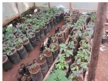
Growth status after transplanting to 30 cm pot size and aphids controlled by manual management