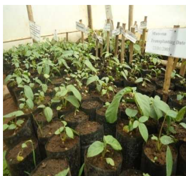
Growth status of S. abyssinica in 15cm pot size after transplanted