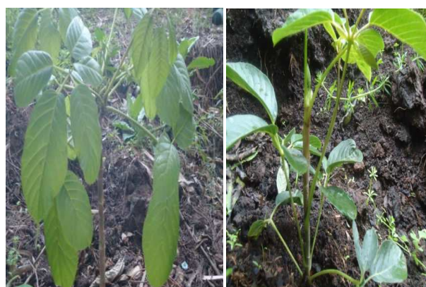
Growth status of S. abyssinica in field condition