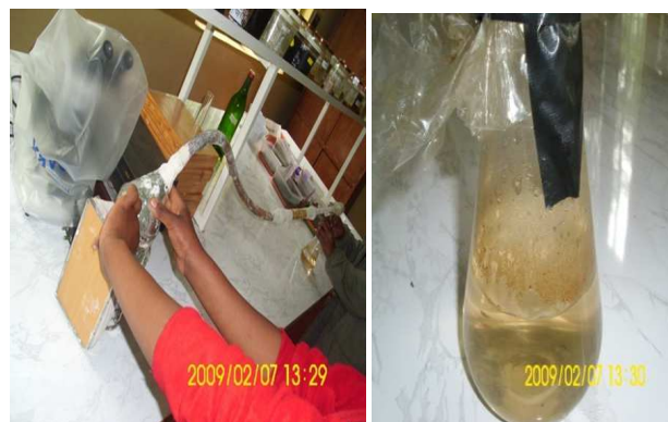
Figure 1. Extraction of concentrated aqueous smoke solution

30 minutes. Then the resulted concentrated smoke water was maintained as a stock solution and used to prepare aqueous smoke extracts of different dilution levels. This method of smoke extraction was based on the method used by Kibebew (2007).