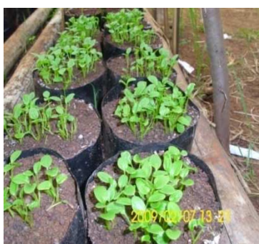
Growth status of S. abyssinica in 15cm pot size before transplanted

establishment of various indigenous trees of Ethiopia. These treatments were used by 15cm pot sizes of equal length (20cm) and then transplanted to 30 pot sizes. Thus, for each provenance, 10 replications were used for the tests. Pots were arranged on wooden bench in the plastic house at random and the mouth of each of them was covered with dried grass stalk. The pots were watered once a day until the experiment ended. At the onset of seedling emergence the grass cover was removed to facilitate counting and to prevent bending of the seedlings due to the force applied by the grass stalk. For the experiment seed germination counts were examined every three days and seedlings with two expanded leaves were removed after recording observations. The trials were carried out until at least > 80% of the replication from each treatment showed no new germination for 2 consecutive counts. Finally, the germination responses of seeds were then expressed in terms of germination percentage, mean germination time, germination rate and germination vigor.