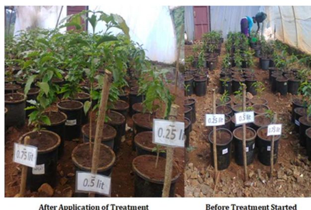
Figure 2. Response coffee genotypes to deficit.

and 80%ETc treatments. This indicated that as the volume of water decreased the water productivity significantly increased. However, some coffee genotypes produced maximum water productivity under 80%ETc this was especially true for H-823. In general, most genotypes gave maximum water productivity under 40%ETc irrigation levels. In contrast, under 40%ETc, coffee seedling exhibited lower dry matter production and retarded plant growth. But under 80%ETc irrigation level, coffee seedlings gave medium water use efficiency, maximum dry matter and promoted vegetative growth. Therefore, the best irrigation strategy for coffee seedlings was found to be 80% of ETc under nursery conditions. This result closely agree with [19] finding that water productivity of coffee seedlings substantially improved with the deficit irrigation.