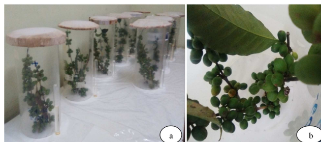
Figure 1. Antestia bugs rearing in laboratory a) Antestia bugs rearing cages and b) Green berry with leaf to feed antestia bugs.

Fresh coffee twigs bearing green berries were provided for the insect at 2-3 days intervals [28]. Although the antestia bug feeds on various parts of the coffee plant, it has a strong preference for mature green berries which are essential for the bug to complete its life cycle, reproduce and enhance its longevity (Figure. 1b) [29]. The combined coffee leaves and coffee green berries were used as rearing substrate. Coffee leaves may improve relative humidity in the containers or provide nymphs with hiding places and helping them to escape from intense light in incubators and the complete life cycle was obtained [30].