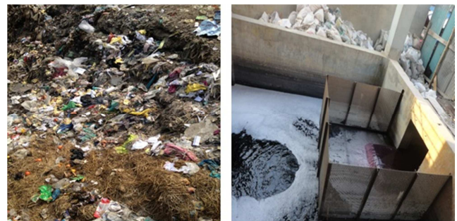
Figure 4. Garments factory waste generation.

Lots of photographs were collected to illustrate the waste management system of the garment factories in Narayanganj city. Some of the photographs have been collected directly from the field survey and some others from daily newspapers as well as from internet website.