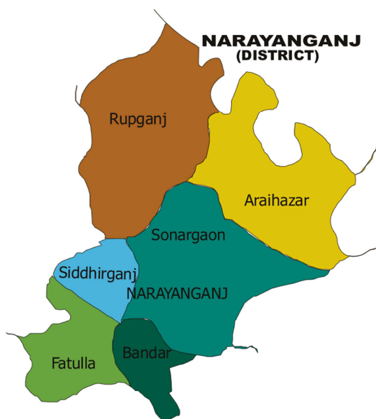
Figure 1. Narayanganj District Map.

In the 1980's the environmental debate gained momentum as methods such as the precautionary principle were being developed and implemented against a rising tide of litigation against organizations possible for environmental degradation [4]. Environmental management practices are often promoted as a cost-cutting opportunity but for many managers this is not a reality. the pressure of implementing green centered around structures such as environmental auditing, impact assessment and accreditation, which has high [10].