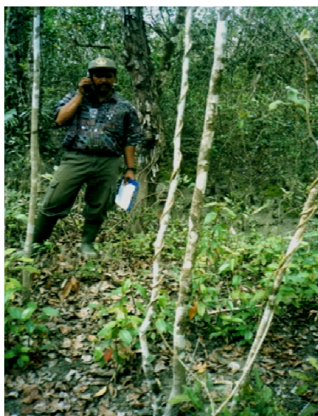
Figure 4.0. Photograph showing the Sundarbans forest trees and understory vegetation. The adult trees behind the author are of Heritiera fomes . The forest floor shows dead leaves from trees affected by top-dying.

Intensive field data collection was made among these nine selected plots (in Figure 3.0). Observations were performed from observation towers during low and high tides, also traversing the forest floor and vegetation on foot, as well as using a speed boat, trawlers, country-boats, and a launch as required to gain access.