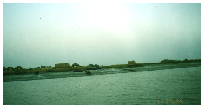
Figure 2.0. Photograph of part of the Sundarbans coastal area, near compartment number 26, where the trees have been cut down to be replaced by a fishing village.

The Sundarbans, like other tidal forests, is tolerant of natural disturbances such as the cyclones and tidal waves of the Bay of Bangle, but it is highly vulnerable to human disturbances (Seidensticker, 1983). Most of the abuses found in professional forestry management elsewhere have been observed here as well, such as excessive cutting of stocks in the auctioned area and connivance between purchasers and forestry staff to cut wider areas than sanctioned (Bari, 1993).