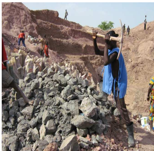
Fig 4. Exposure to mine dust through manual mining and processing of mineral ores

Some organic compounds such as Dichlorodiphenyltrichloroethane (DDT), Polychlorinated biphenyls (PCBs) and Dioxin - 2,3,7,8-tetrachlorodibenzo para dioxin (TCDD) may be classified as carcinogens, neurotoxins or irritants; others may cause reproductive failure or birth defects (World Health Organization, 1988)