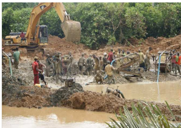
Fig 3. The small-scale mining activities undertaken along the river bed in denawase, Ghana