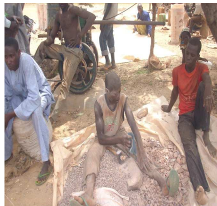
Fig 5. Exposure to lead particles and dusts in Nigeria Village.