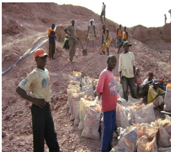
Fig 2. Indiscriminate small-Scale mining and manual bagging of Pb and Zn ores and other materials in Nigeria