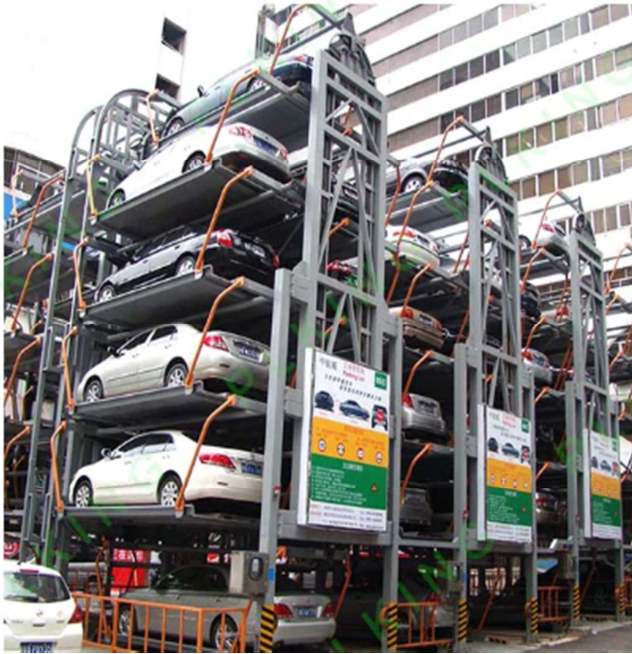
Figure 5. Model of vertical rotary structure.

Model of vertical conveyor structures, manufactured by China and India, have been exported to many countries. (Figure 5). The features of these approaches are as follows [15, 16]: