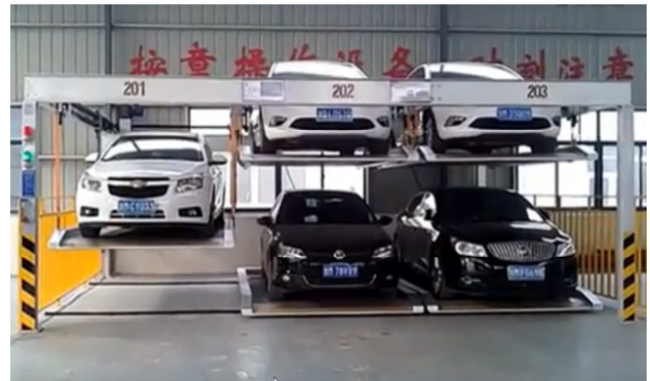
Figure 6. Model of 2 level parking with horizontal sliding system. ( https://www.youtube.com/watch?v=l_dWzF7qUVY ).

However, parking models of 2- or 3-level sliding system (as in figure 6) do not look too complicated, have a compact structure and are convenient for layout even in the basements of apartment buildings.