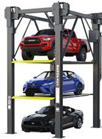
Figure 2. Residential multi-level garage models with 4 pillars.

- Models of shared space car garage (Figure 3):