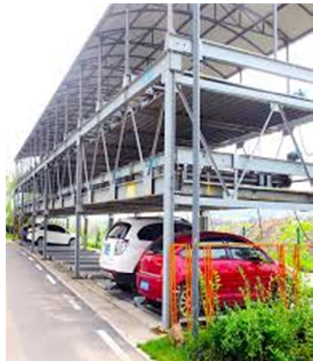
Figure 7. Prefabricated steel building structure for cars and motorbikes parking [16].

2-level garage models where ground level for cars and upper levels with lighter structure for motorbikes (figure 7).