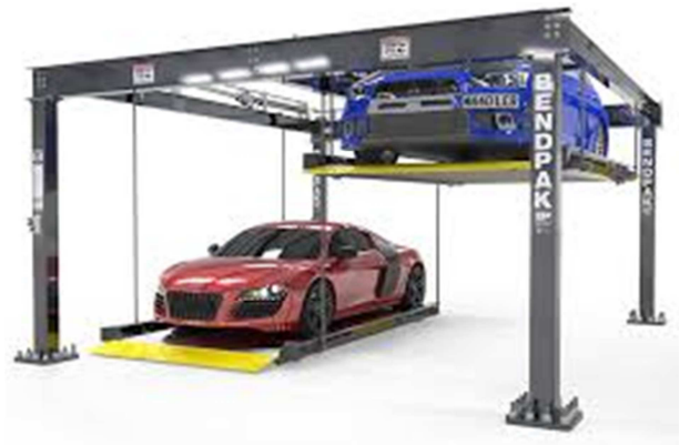
Figure 3. Multi-level garage models with shared space.

- Models of shared space car garage (Figure 3):