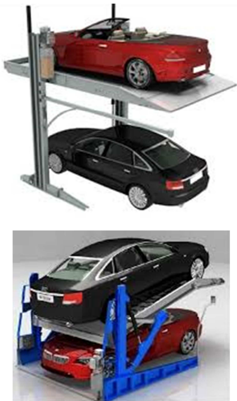
Figure 1. Residential multi-level garage models with 2 pillars.

- 2-level garage model for residential housing with 2 pillars or 4 pillars (Figures 1 and 2):