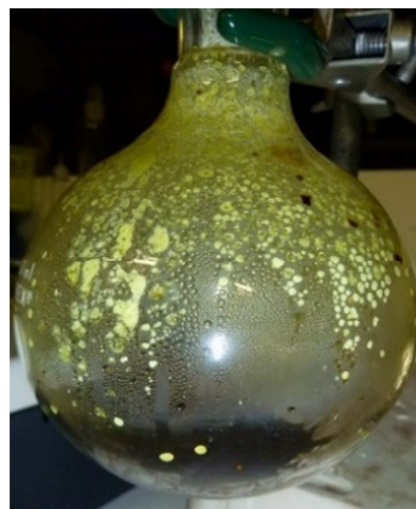
Figure 2. Pyridine-3-carboxylic acid crystals on the walls of reaction flask.

It was observed that the PCA crystals were white (Figure 2), odorless and formed a clear solution on dissolution in water. The resultant solution gave no color change with 2,4-dinitrochlorobenzene and sodium hydroxide at 60\text{--}70^\circ\text{C} . Available literature confirms that PCA and its immediate derivatives are pyridine ring compounds and shows no color change with 2,4-dinitrochlorobenzene. This confirms that the compound synthesized in this study is pyridine-3-carboxylic acid. The results proved that PCA extracted from FCV tobacco wastes exhibit similar characteristics as that reported in literature [15]. Though there were deviations from the standards, this could be due to conditions not achieved in the laboratory and some errors such as due to parallax.