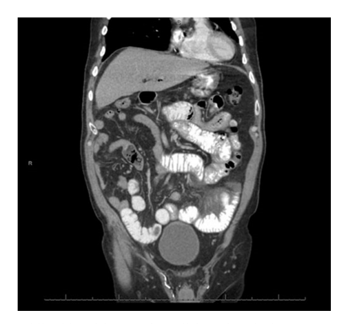
Figure 1. Mildly dilated loops of small bowel with decompressed loops of small bowel in the right lower quadrant.

Two weeks after admission, the patient was seen in gastroenterology clinic and complained of epigastric and poorly localized discomfort, early satiety, nausea, and diarrhea/loose stool. Patient stated he was adhering to full liquid diet and pantoprazole. A CT enterography was ordered and showed: jejunal diverticulitis with microperforation and significant phlegmon surrounding the inflamed diverticulum, no abscess in the abdomen, and few scattered diverticula in the jejunum. The patient was subsequently started on ciprofloxacin 500mg twice daily and metronidazole 500 mg thrice daily for seven days. Pt was seen in clinic two weeks later with complete resolution of symptoms after course of antibiotics.