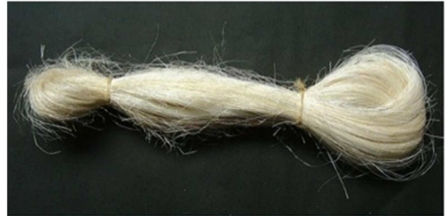
Figure 3. Sisal fiber [34, 39].

tropical and sub-tropical world especially in the central American region, but the most important varieties for fiber production on commercial scale are: Agave Sisalana (commercially refers to as 11648) and the Agave fourcroydes (called Henequen)