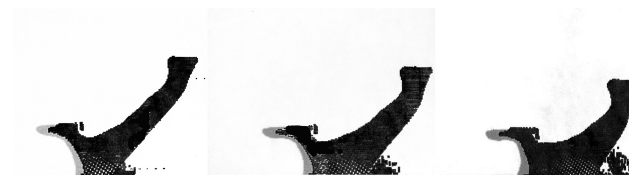
Fig.2. Dynamics of cumulative plasma jet formation. From left to right: t=1.357 ns, v=77.41 km/s; t=1.5 ns, v=95.91 km/s; t=1.625 ns, v=115.88 km/s.

The comparison with the parameters of the jet formed from the "ordinary" conical target from CE and experiment [2] showed that the increase of the plasma jet speed in the suggested configuration is 25-30% and the increase of jet pulse is more than 90 times.