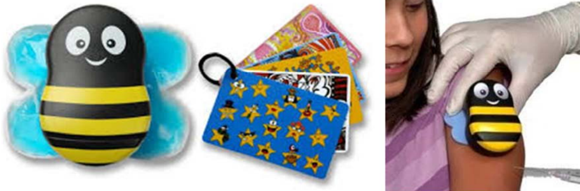
Figure 1. The Buzzy and distraction cards.

parents did not consent and 9 due to protocol violations (i.e., pre-treatment scales were not completed) (figure 2).