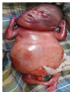
Figure 2. Fetus showing club foot, syndactyly, malformed ears and cryptophthalmous.

Ultrasonography also revealed oligohydramnios. Due to the above mentioned anomalies, medical termination of pregnancy was done. On gross examination, the fetus showed grade 3 microtia of ears, saddle depression of dorsum of nose, syndactyly in fingers, cryptorchidism and micropenis and bilateral clubfoot (Figure 2).