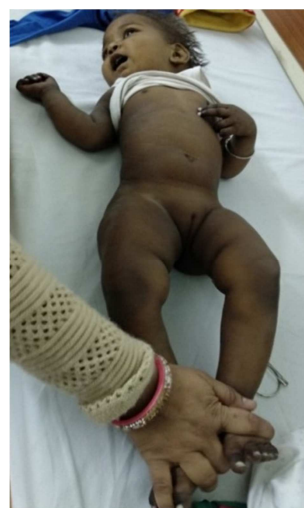
Figure 1. Generalized diffuse hyperpigmentation.

A final diagnosis of Infantile Tremor Syndrome (ITS) was made. The child received packed red blood cells (100 ml, Inj. B 12 (1000 microgram on alternate day), syrup Multivitamin, syrup Iron (3ml od) and syrup Calcium and vitamin D along with initiation of complementary feeding showing improvement. Within 48–72 hours there was improvement in activity and responsiveness. Hematological recovery was observed within 5–7 days. Skin pigmentation started to resolve in about 2–4 weeks. Lost developmental milestones began to return by 4 weeks and hair changes took several months.