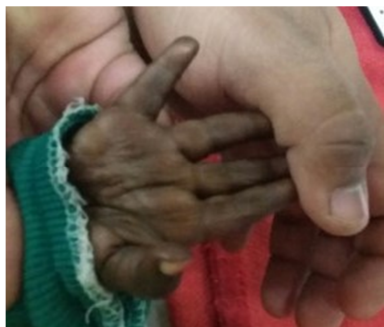
Figure 3. Hyperpigmentation accentuated over palmer creases.

In infants and young children, vitamin B12 deficiency is manifested always secondary to maternal vitamin B12 deficiency and is, therefore, seen in exclusively breastfed infants of mothers who are either strict vegetarian or have an underlying pernicious anemia. [4-6]. NVBD can affect hematologic, gastrointestinal and nervous system. [7] Infant with vitamin B12 deficiency clinically presents as apathy, neurologic symptoms of irritability, psychomotor regression, hypotonia, and involuntary movements. [4-6, 8] Muco-cutaneous involvement occurs as glossitis, angular cheilitis, skin hyperpigmentation, and hair abnormalities. [4-6]. Hair changes have been reported in 50%-100% Indian infants with vitamin B12 deficiency, as in our case. Almost all the children with associated vitamin B12 deficiency present with lusterless, sparse and brown hair.