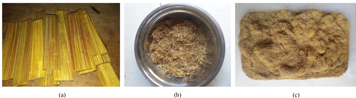
Figure 1. (a) bamboo strip; (b) bamboo fiber; (c) bamboo powder.

PLA/bamboo composite was made with pellet thermoplastic PLA NV that has a processing temperature between 190°C and 250°C [25]. A hot press molding technique was used at 20 kPa pressure and 220°C for 40 minutes. The mixture of molten PLA and bamboo was pressed onto a tensile testing sample following ASTM D790. The amount of bamboo added was constant at 10 wt%. The mold was smeared with grease to ease the collection of the final product. The mechanical properties were investigated using a Universal Testing Machine (Tension) with a maximum load capacity of 5 kN. The tensile testing was done at a speed of 1 mm/min.