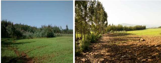
Figure 3. Morning shading effect of Eucalyptus globulus plantation on crop lands.

crop. The main effects (direction and distance) had highly significant effect on the grain and biomass yield of wheat ( P < 0.001 ) (Table 2). The grain and biomass yield of wheat increased significantly as the distance (10 m) from the Eucalyptus stands increased in all directions (Figure 1).