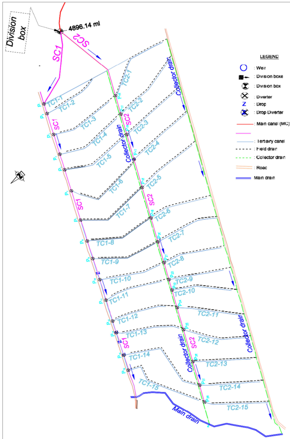
Figure 2. Layout of Kidwebezi Irrigation Scheme (IRRI Burundi, 2021).

left (SC2), divert water from the main canal and distribute it into the tertiary canals. The secondary canals are both divided into 15 tertiary canals which irrigate from plots of different size designed in way that facilitate their management and easiness of water distribution. Also, the scheme comprises field drains, two collector drains and the main drain to remove the excess water from the field.