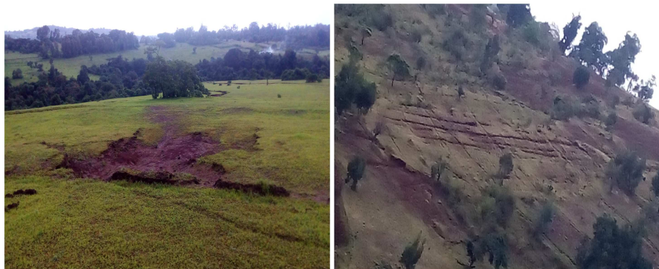
Figure 2. Gully formation from bund already constructed on cultivated lands in Diga and Horo districts (during the survey).

The risk of damage of structures was always happened due to an exceptional storm and un appropriate designing of the structures. Failure to pay attention to this point can lead to greater erosion than if the structures had not been installed in the first place. Where there are a series of structures on a hills slope there is a risk if a structure was broken near the top, then those downhill would also get damaged [12]. Moreover, during field observation, soil erosion and gully formation were observed on cultivated and grazing lands (Figure 2). Gully formation and expansion is one of the major problems in degraded watersheds that reduces the cultivable area and grazing lands [12]. According to Bancy M vegetative materials should have to be required for bund stabilization at least in every season [13].