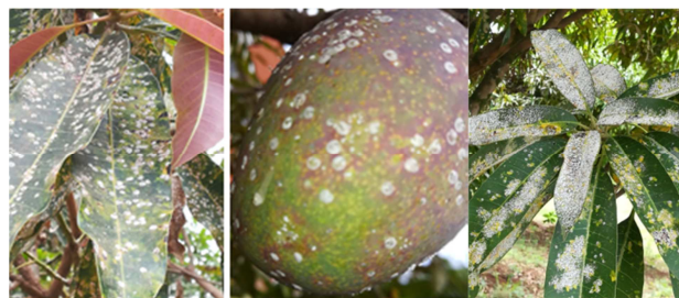
Figure 1. The infestation of white mango scales on leaves, fruit and mango tree.

In Ethiopia, white mango scale was first recorded in Loko, Guto Gidda district, east Wollega zone of the Oromia region on August, 2010 at Green Focus Ethiopia Ltd [17]. The pest infested all stages of the crop at Green Focus Ethiopia. It caused yellowing and drying of leaves, leaf drop, die-back of twigs and ultimately killing of the crop. Heavy infestation killed leaves and branches. Additionally, the infested mango fruits showed conspicuous pink blemishes around the feeding sites of the scales, which affecting the commercial value of the fruits and export potential [18, 19] (Figure 1). The pest distributed immediately to the other adjacent administrative peasant associations of Guto Gida districts in the Anger Valleys [17]. At that time, farmers were uprooted mango trees from their farm because there were no available management options since the pest was new for them. And then, the infestation of pest has been speeded at an alarming rate and recorded at Gida Ayyana, Sassiga, Limu and Diga districts [17].