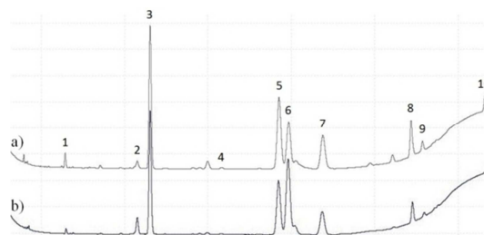
Fatty acids: 1 - \text{C}_{14:0} ; 2 - \text{C}_{16:1} ; 3 - \text{C}_{16:0} ; 4 - \text{C}_{17:0} ; 5 - \text{C}_{18:2} ; 6 - \text{C}_{18:1} ; 7 - \text{C}_{18:0} ; 8 - \text{C}_{20:3} ; 9 - \text{C}_{20:4} ; 10 - \text{C}_{22:6}

Patients with MODS had marked changes in the composition of plasma fatty acids (Figure 1).