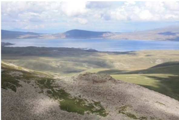
Figure 2. Abuli fortress. Lake Paravani in the background.

The main part of its territory is the volcanic plateau surrounded by ridges from north, east and south. Javakheti stands apart from Georgia's other regions for the peculiarities of its natural conditions; its landscapes are in sharp contrast with those of the neighbouring regions. Flat relief of the unforested Akhalkalaki plateau is particularly emphasized by angular relief of the adjacent Trialeti ridge, with its dark coniferous woods and subalpine and alpine landscapes. Karl Ritter a famous 19th century German geographer called Javakheti "a cool island in the South Caucasus rich in air and water".