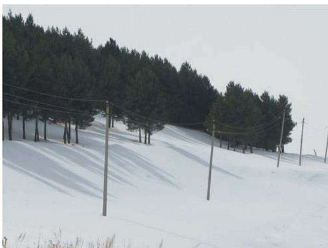
Figure 6. Winter in Javakheti.

There are lots of low temperature mineral water high-output, so-called lava vacluses (in headwaters of the Rivers Kulikhami and Abulistskali). On coasts of the lakes Paravani and Sagamo there are warm volcanic springs (36°C). These springs have no medicinal value but they can be interesting to campers and adventure tourists. It should be noted that in the region there are no spa tourism resources, there is only one climatic resort area – Chobareti.