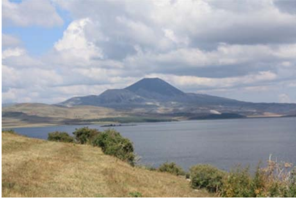
Figure 1. Lake Tabatskuri and Mountain Tavkvetili.

Georgia. According to Georgia's geomorphologic scheme compiled by Levan Maruashvili, a famous Georgian geographer, it is a part of Southern Georgia's Plateau zone which consists of Akhalkalaki plateau, Javakheti lake area, Nialiskuri hill, regions of the Samsari and Javakheti ridges and Tabiskuri (Tabatskuri) subregion [5].