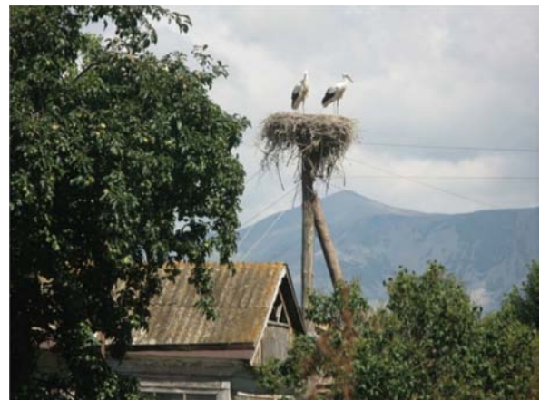
Figure 3. Pelicans near lake Madatafa.

Lakes hold a special place in natural potential of Javakheti tourism development. In total there are 56 lakes in Javakheti, of which six range from 4 to 40 sq. km (table 1). There is the largest lake of Georgia - Paravani among them. The lakes are mostly of volcanic and tectonic origin. The large lakes of Javakheti are rich in fish and aquatic animals, which make them a good habitat and gathering place for wild birds. The route of migrant birds passes over these lakes. The Javakheti ecosystem is a famous habitat of birds most of which are entered into the Red List. 112 bird species nest in Javakheti which creates good conditions for development of one of the types of ecotourism, and birdwatching. White Pelican is the most widely spread species of wild birds in the area. They build their nests on electric polls and on the roofs in the villages around the lakes.