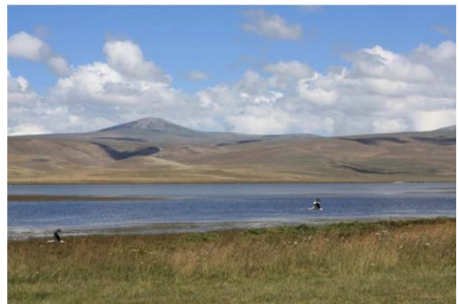
Figure 5. Madatapa Managed Reserve.

Javakheti National Park, Kartsakhi, Sulda, Khanchali, Bughdasheni and Madatapa managed reserves were established in 2011. They are aimed to protect landscapes of the large lakes and marshes of Southern part of Javakheti – mainly for protection of water fauna and water-plants' ecosystems.