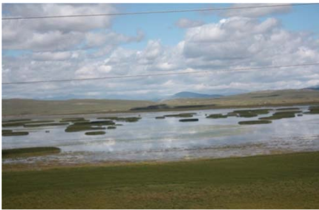
Figure 4. Lake Khanchali.

The problem of Khanchali lake must be mentioned especially. Unlike other lakes the water level here is very low – only 80 sm. That facilitates feeding for wading birds. Also water in the lake is comparatively warm. Hence the largest colony of wild birds used to be there. Earlier Khanchali Lake was the forth in Georgia by surface area. In the 1990s by the initiative of local government a dam was built there and the lake lost one third of its space. Water was used for agricultural purposes. As result of unadvised meliorative works thousands of birds disappeared from the lake and never returned to their old habitation [7]. This fact can be qualified as a local ecological disaster.