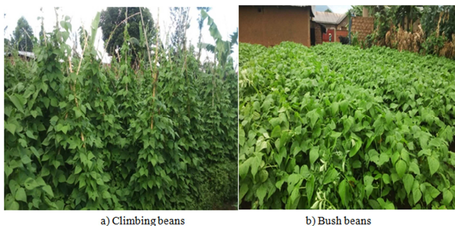
Figure 2. Climbing beans (a) and Bush beans (b) in the study area in 2018.

Climbing beans is a priority crop in Rwanda, occupying the largest arable land and consumed by nearly all, the urban and the rural populations. It has multiple benefits of food and nutrition as well as income security. Climbing beans cultivation dominates in the Northern Province, which is characterized by high elevation, cooler temperatures, and precipitation throughout the year [5]. Bush beans are most frequently cultivated in the Eastern Province, a low-altitude area with warmer temperature. Bush beans are also commonly grown in areas surrounding Kigali and in a few districts in the Southern Province, which is mostly a low-altitude zone and less rainfall.