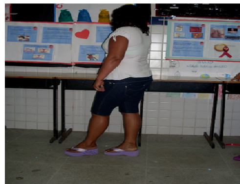
Figure 3. Presentation of the student seminar series on 8th sexual education and sexually transmitted diseases for high school classes and teachers.

This work was conducted in public school located in João Pessoa-PB, in the State School of Primary and Secondary Francisco Campos. We address the issue of Sex Education and its prevention of sexually transmitted diseases, then mentioned that one way to get a good quality sex life, and have information about their partners who are in physical contact. From this conversation with students from 8°-serie-EJA, treat the subject on prostitution and human behavior. In this present study we conducted on these issues, with contextualized lessons and discussions in class, in group's seminars and a workshop room with a view to promoting greater awareness of the issues. Figures 3 and 4 illustrate the seminars on Sexual Education and Sexual Life Quality in workshops presented to the school community.