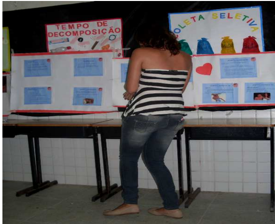
Figure 4. Presentation of the student seminar series on 8th sexually transmitted diseases and prostitution for high school classes and teachers.