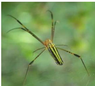
Figure 14. Nephila sp.