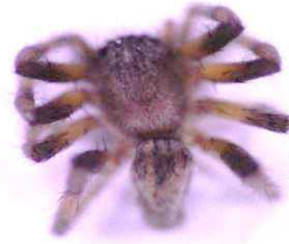
Figure 17. Clubiona sp.

Widely distributed from temperate to the tropical regions. At present there are 426 species recorded and 20 species were known in the Philippines [12]. This group usually found within the bushes [21].