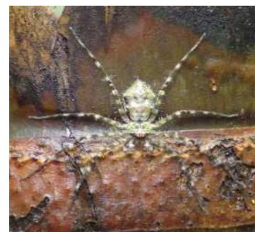
Figure 19. Heteropoda sp.