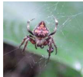
Figure 11. Neoscona sp.

The genus Neoscona are pantropical in distribution. Their abdomen has a distinguishing pattern and longitudinal groove on the carapace which separates all species which separates them from other species in Araneus . Worldwide there were 81 species and 11 were recorded from Philippines [12]. This group preferred areas with high prey density [20].