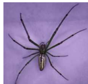
Figure 29. Leucauge sp.