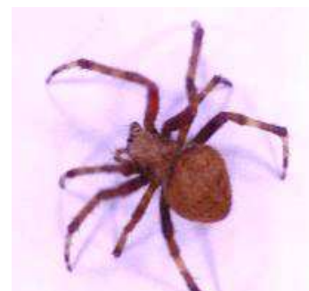
Figure 12. Neoscona sp.