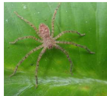
Figure 18. Heteropoda sp.

This main group of Sparassidae distributed in the tropical region of Asia and Australia. Worldwide there are 209 species and 2 were known in the Philippines. These are known foraging spiders, they don't built webs to capture prey but more or ambush type of strategy [12].