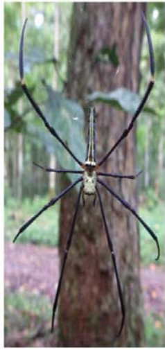
Figure 13. Nephila maculata (female).

the world, with species in Australia, Asia, Africa and America. This group of spiders preferred warmer condition of habitat. Old records that 105 species were recorded worldwide and 3 species were known in the Philippines [12].