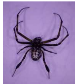
Figure 27. Leucauge argentina.