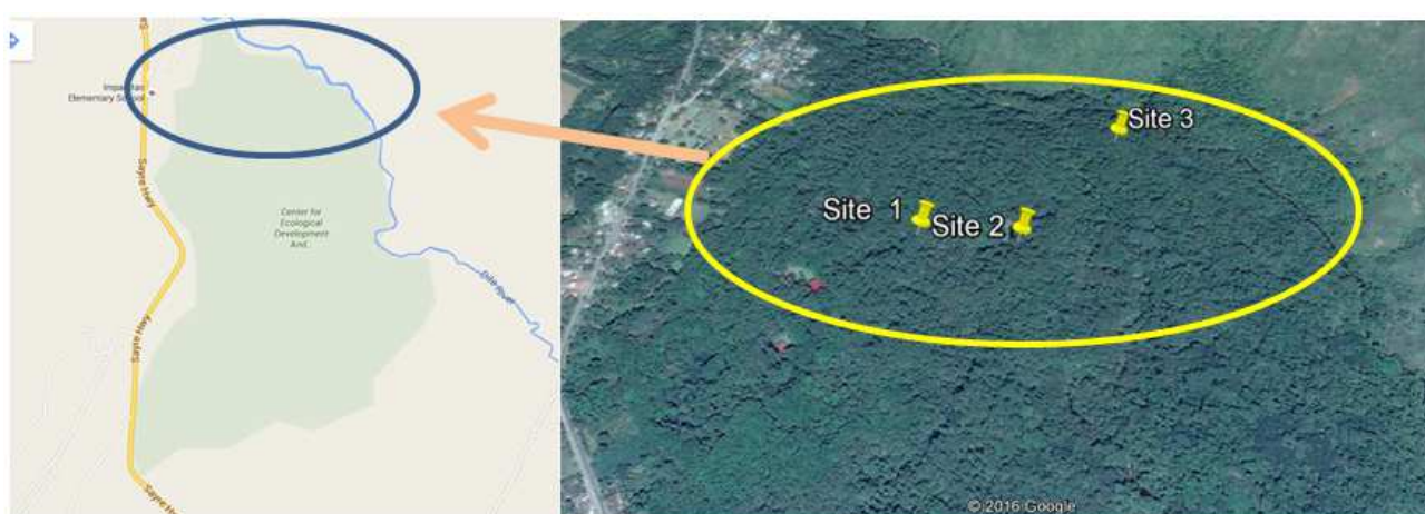
Figure 1. Site map of CEDAR, Impasug-ong, Bukidnon (left) and the sampling sites (right). (Google Earthpro).

forest. In the study, three sites were established, site 1 the roadside going the nearby stream, site 2 nearby stream and site 3 was along the mixed dipterocarp area. Site 1 was located 752m asl with a coordinates of N 08°15'8.00" and E 125°1.0'59.0". The area was quite open and along the side it consists of plants like palm species, some grasses, giant bamboo species, old growth trees and shrub. While site 2, was located 725m asl with coordinates of N 08°15'8.00" and E 125°2.0'5.0", near along the nearby stream which consisted of herbaceous plants, some ferns like Asplenium nidus , shrubs, Arum plants, giant bamboo species, few old growth tree and grasses. Then site 3, was located 743 m asl with the exact coordinates of N 08°15'17.00" and E 125°2.0'11.0", the area found between the Calatungan Falls and Dila Falls. It was composed of giant bamboo, some fern species like Pyrrosia species and young growth trees. The forest floor was filled with leaf litters and only few grasses and shrubs thrive in. All three sites were considered a disturbed habitat.