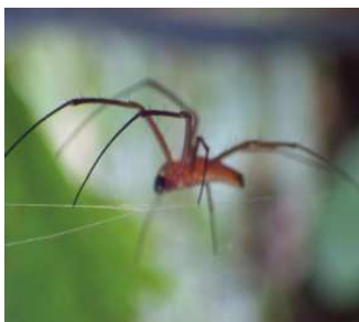
Figure 16. Nephila maculata (male).