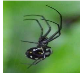
Figure 25. Leucauge argentina.