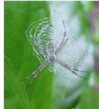
Figure 10. Agriope sp.

to the temperate regions. They are known for striking pattern on their abdomen and its zigzag form on their webs called the stabilimentum. In the Philippines, they are known as gagambang ekis ("X spider", again due to the stabilementa). Worldwide there are 76 species recorded and 6 were found in the Philippines [12].