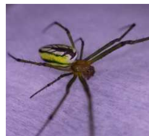
Figure 28. Leucauge sp.