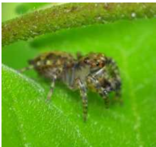
Figure 22. Chalcotropis.