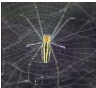
Figure 15. Nephila sp.