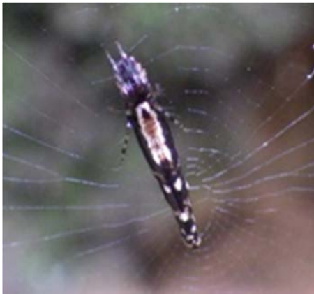
Figure 3. Cyclosa sp. 1.

The genus Cyclosa were known for their decorative design on their web as their camouflage to deceive the prey. They were distributed from temperate forest to the tropical region. [12] showed that there were 165 species worldwide and 22 species were found in the Philippines. These species preferred to build its web near the forest floor at the forest edge [10].