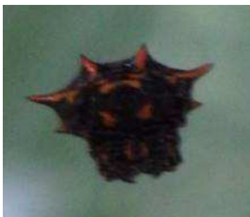
Figure 8. Gasteracantha sp.