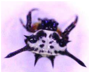
Figure 7. Gasteracantha sp.