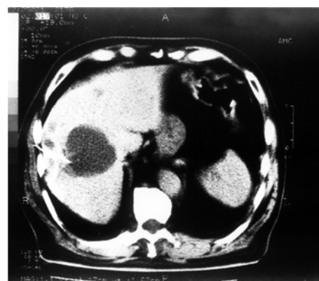
Figure 8. Patient with hepatic abscess drained under CT control.

Only in 5 cases with insufficient presentation of small amount of fluid and to define a safe percutaneous window allowing access to the collection for avoiding vascular structures and bowel loop, CT control was used. On Figure 8 hepatic abscess which is punctured under CT control is shown.