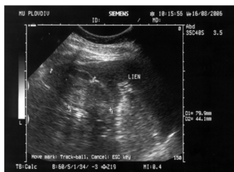
Figure 4. US image of the patient with subcapsular haematoma of the spleen.

In 18 of all cases septated cystic lesions was presented and that provoked interventional (FNA and FNB) procedures for cytologic and if it is possible histologic investigation of taken tissue. The results was mucinous pancreatic cystic neoplasms. In these cases surgical interventions were performed to prevent cancerous degeneration of the lesions (figure 5).