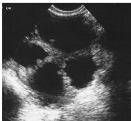
Figure 5. US image of macrocystic pancreatic neoplasm.

In 18 of all cases septated cystic lesions was presented and that provoked interventional (FNA and FNB) procedures for cytologic and if it is possible histologic investigation of taken tissue. The results was mucinous pancreatic cystic neoplasms. In these cases surgical interventions were performed to prevent cancerous degeneration of the lesions (figure 5).