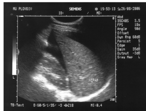
Figure 2. US image. The free liquid in the abdomen (hemoperitoneum).

In 65 of patients hemoperitoneum was presented (Figure 2). In 42 cases the US examination reveiled localized haematomas, without clinical manifestation. They were discovered incidentally (Figure 3).