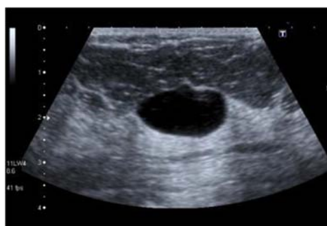
Figure 6. US image of simple cyst of left mammary gland.

Only in 5 patients observed the cysts of the mammary glands (Figure 6). The patients was examined due to lump palpated after trauma of the mammary gland.