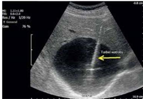
Figure 9. US image of hepatic abscess drained under US control.

the interventionalist to visualize not only penetration of catheter in the abscess cavity as to control therapeutic process as well as to present proper position of catheter during the evacuation of the fluid and insertion of medications.