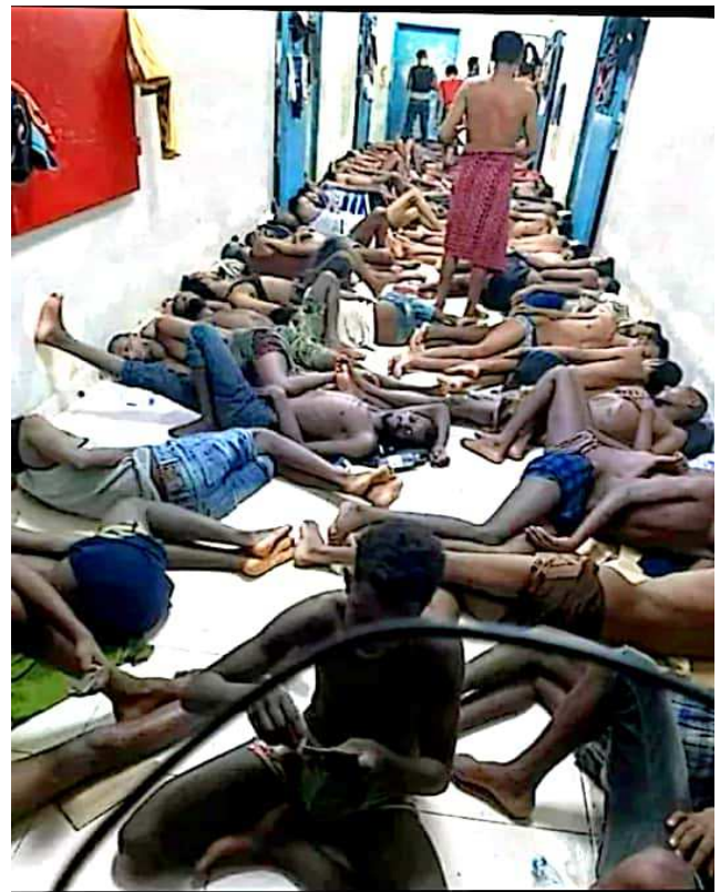
Figure 2.

exploitation, harassment and violence. The following figure show Ethiopian irregular migrants jailed in Saudi Arabia.