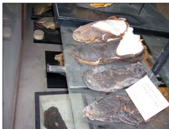
Figure 2. Shows the vegetable tanned leather shoes in the Agricultural museum and the shoe. No. 1731.

A biological swab were taken from a vegetable tanned leather shoe belonged to Mamluk era (No. 1731) from the Agricultural museum in Dokki – Cairo – Egypt to identify the biological colonies which deteriorated it – Figure (2).