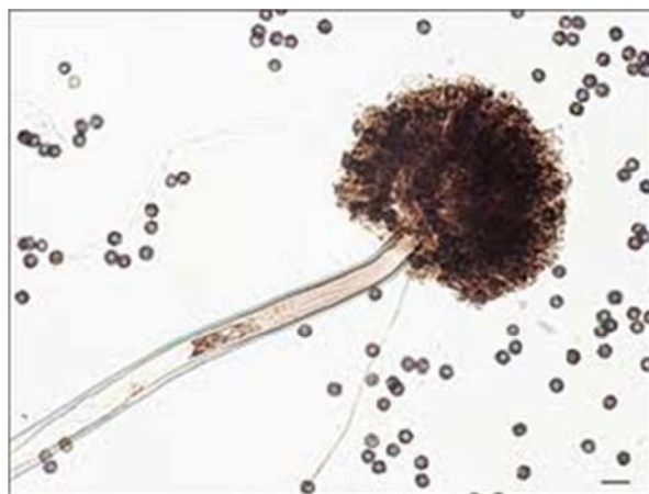
Figure 4. Shows Aspergillus niger under the microscope.