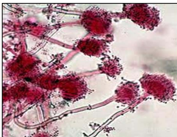
Figure 3. Shows Penicillium notatum under the microscope.

We found 6 types of fungi as followed in table: