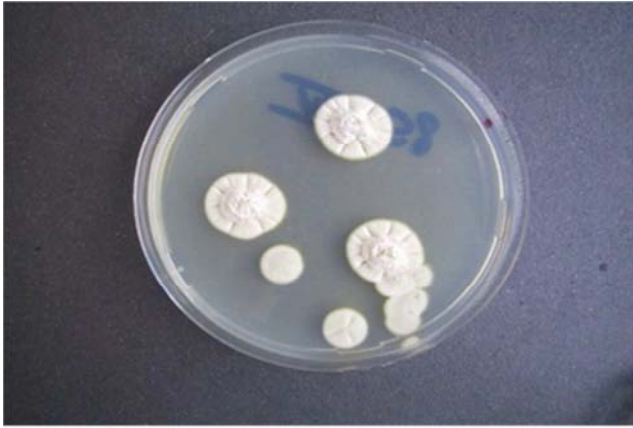
Figure 5. Shows Penicillium egyptiacum .