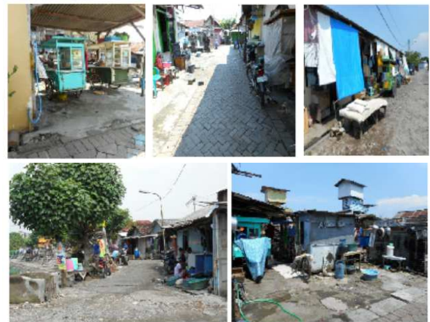
Picture 6. Women's occupation in Kalisari's Fishermen Settlement.