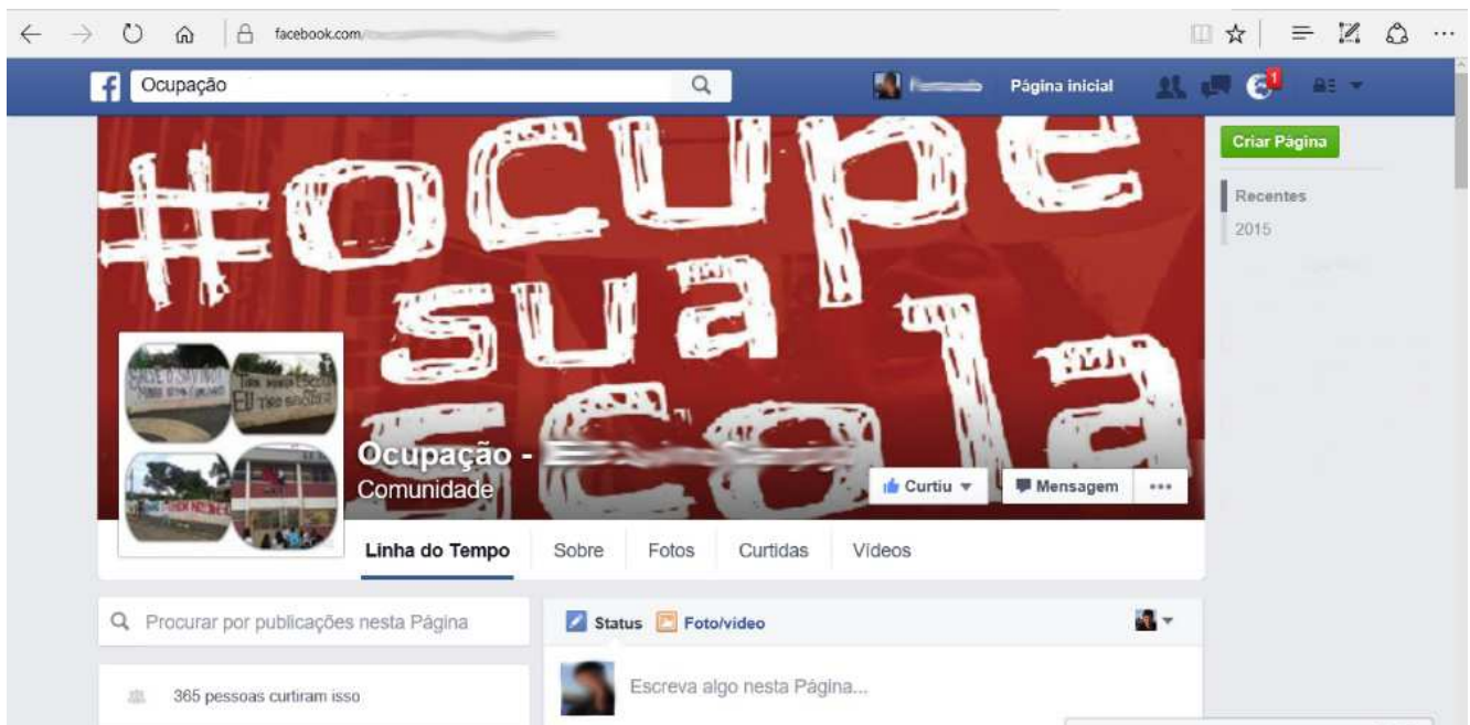
Figure 1. Example of a Facebook page of the movement 'Do not close my school'. The name of the school and other personal information in the page were blurred.

By using multimodal analysis of the pages, we identified some common characteristics among the pages of the movement. First, the profile pictures of the pages were mainly with a picture of the school building or with the school name. Those pictures demonstrated that, although the movement 'Do not close my school' was a student movement, they were connected to the school and that the school was the centre of attention. Second, the cover pictures showed statements such as: 'the school is ours', 'we do not want the reorganization' or 'occupy your school'. Third, there were only posts made by the pages' owner. Those cover pictures can be associated with the anti-reorganization tone of the protests. Figure 1 depicts one example of the Facebook pages of the movement. On a red background, we observe the statement #occupy your school [#ocupe sua escola] as a cover picture, and four small pictures of the school as profile picture.