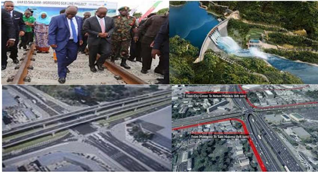
Figure 1. Various Strategic Projects under construction in Tanzania.