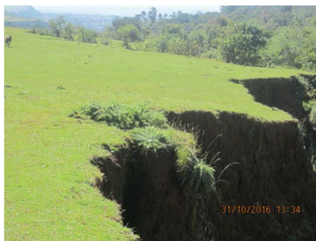
Figure 2. Gullies in the study areas.

Land, being the major resource of livelihoods of the respondents, is used for different purposes as listed by themselves as the following; home garden (35%), cultivated field (30%), forest (15%), grazing area (20%). Almost all of them (99%) indicated the existence of pockets of areas in the landscape where ecosystems are protected under formal or informal forms of protection, but one replied otherwise. The respondents were asked how they manage common resources (e.g. grazing land, wildlife, forest), and gave the following mechanisms; with the help of grazing regulation (8%), control of wildlife poaching (10%), control of deforestation (3%), and a combination of all these (47%). However, 32% of them reported that the common resources are not managed sustainably. So as to identify the load on the common resources, they were asked about the general status of exploitation of common resources, and 48% of them said the common resources are sustainably managed, 49% of them said the common resources are partially managed and 3% of them said the common resources are overexploited. When asked