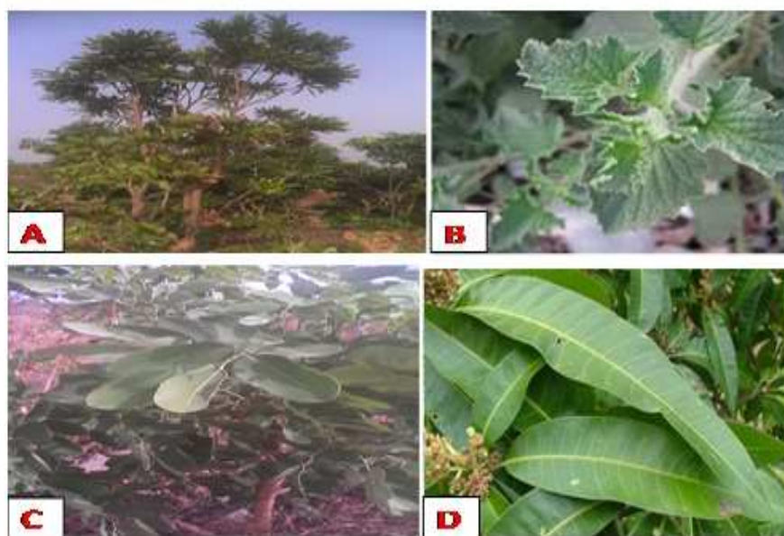
Figure 4a. Most abundant species in Minna-Bida Vegetation Study (A: Vitellaria paradoxa B: Hyptis suaveolens C: Daniellia oliveri D: Mangifera indica ).

Conservation status of plant species encountered: V (Vulnerable), T (Threatened), DD (Data deficient), LC (Least concerned)