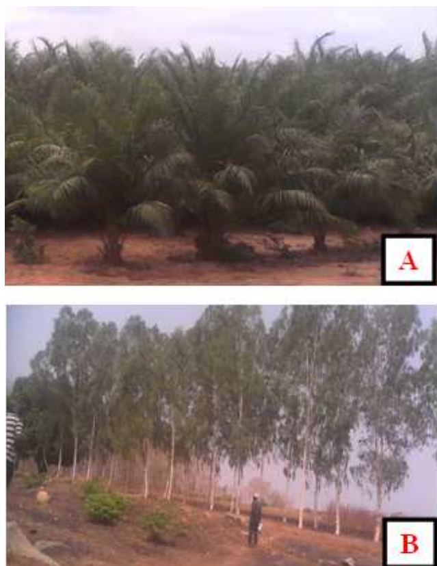
Figure 1. A: Oil Palm Plantation along Minna-Bida Road (N 9° 14' 49.3s; E 006° 9' 24.5s) B: Eucalyptus and Teak Plantation at Garatu Village (Federal University of Technology).

biodiversity can only be conserved through vigorous human actions for the preservation of these tree species within their various ecosystems [16]. Clear evidences of individual efforts to resuscitate some parts of the areas through mono-cropping; plants like palm oil, Eucalyptus , and Tectona grandis (Teak) abound along the road (Figure 1) have been commended.