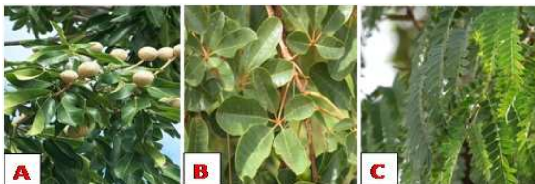
Figure 4b. Least abundant species in Gaffar community project site (A: Khaya senegalensis B: Vitex doniana C: Prosopis africana ).

The family that has the highest number of species (9) i.e. most frequent family is Fabaceae. This is followed by Poaceae (4 species), then Malvaceae (3); Lamiaceae, Combretaceae, Arecaceae and Meliaceae had two species each. Acanthaceae, Anacardiaceae, Annonaceae, Araceae, Asparagaceae, Asteraceae, Bignoaceae, Cochlospermaceae, Euphorbiaceae, Lentibulariaceae, Nymphaeaceae, Rubiaceae,