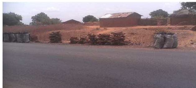
Figure 2 Piles of Firewood and Bags of Charcoal ready for sale at Tsadza Village.

changes in species distribution and diversity largely depends upon the covered area, association between local and native species diversity while spatial gradients like, elevation, latitude, longitude environmental factors including soil factors and productivity determine diversity pattern [17].