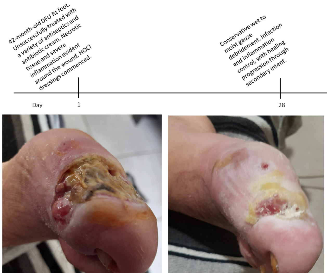
Figure 2. Treatment of diabetic foot ulcer using hypochlorous acid dressings. A 45-year-old diabetic male presented with a diabetic foot ulcer (DFU) measuring 5 cm x 3.5 cm on the medio-plantar aspect of the right foot, between the 1 st metatarsal head and the proximal phalanges of the big toe. This wound was previously unsuccessfully treated with a variety of antiseptics and antibacterial agents. Daily HOCl-wetted gauze dressing retained with crepe bandage demonstrated satisfactory healing after 28 days. Due to the patient relocating, no further follow-up was possible.

Daily HOCl dressings demonstrated satisfactory wound progress after 28 days. Wound exudate diminished during the first four days of dressings, with concomitant reduction in wound inflammation. During the following 24 days conservative wet to moist gauze debridement was successful in removing all necrotic material from the wound bed, with no need for surgical intervention. Due to the patient relocating, no further follow-up was possible after 28 days.