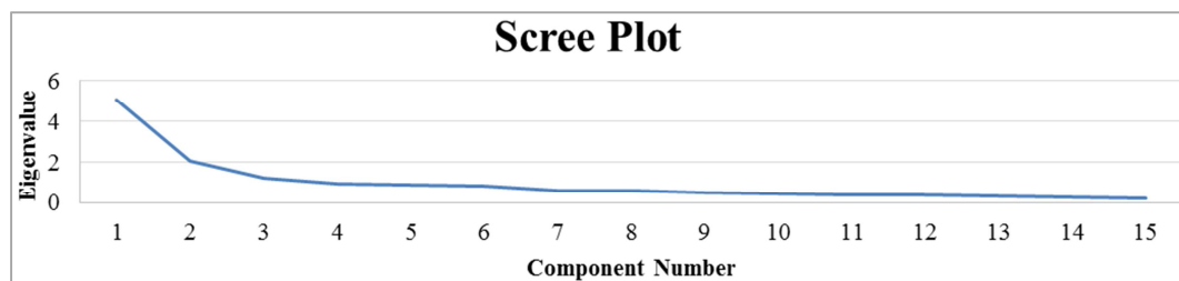
Figure 2. Scree Plot.

The principal component analysis extraction method shows that three components are better explained, with a total variance of 55.89%. This indicated that 55.89% of the variance was explained by prior work experience, education, and financial resources. The scree plot also indicated four factors having an Eigenvalue of one and above prior work experience, education level, financial resources, and strategic planning. The scree plot is presented in Figure 2, where the Eigenvalue is plotted against components. The twelve factors share the remaining variance explanation.