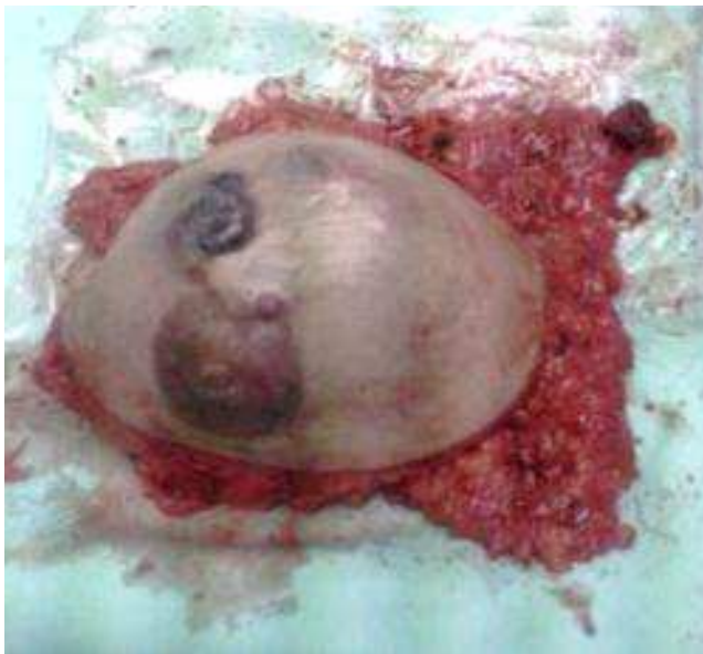
Figure 1. Operative specimen: Left breast specimen with multiple satellite nodules and axillary lymph nodes.

However since her breast lump was increasing in size and causing pain to her she was advised and agreeable for left mastectomy with axillary sampling. Her provisional clinical diagnosis was left breast cancer with liver metastasis. Intraoperative findings were left breast mass which was fixed to pectoralis major. (Figure 1) Multiple breast satellite nodules and axillary lymph nodes were present. Left mastectomy with axillary clearance was performed.