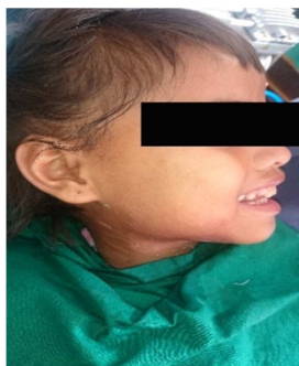
Figure 3. Post-op after 1 week.