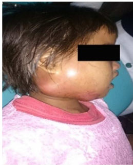
Figure 1. Pre operative.

Irrigation with metrogyl and betadine were done in buccal and submandibular spaces on daily basis and once there was no evidence of pus discharge, the drains were removed. The infection and swelling was subsided after one week. Histopathological report showed fragments of adipose tissue displaying dense infiltrate of mononuclear cells and many foamy macrophages with interspersed neutrophilic aggregates. There is marked hyperemia and scattered hemorrhage suggestive of severe sub-acute inflammation. A complete blood count was done again; All the blood values were found to be within the normal range. Then the patient was discharged from the ward.