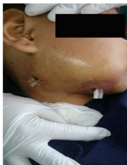
Figure 2. Intra operative.