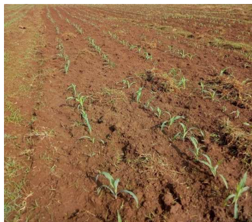
Figure 3. 1 st cultivation practice.