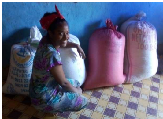
Figure 7. Grain yield of maize.