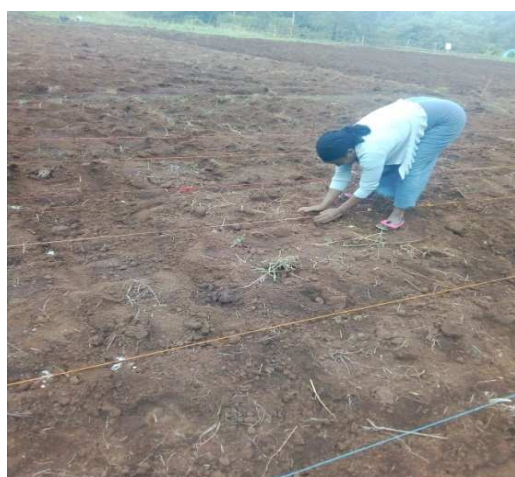
Figure 2. Field layout and maize planting.