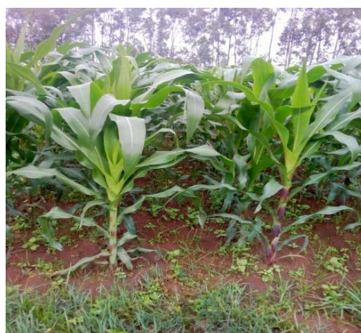
Figure 4. Maize at knee stage.

Harvest index: was computed as the ratio of grain yield (GY) to the total above ground Dry-mass (DM) yield. Straw yield: was determined by subtracting grain yield from above ground dry biomass.