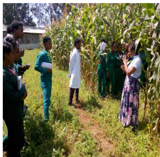
Figure 5. Research site as demonstration.