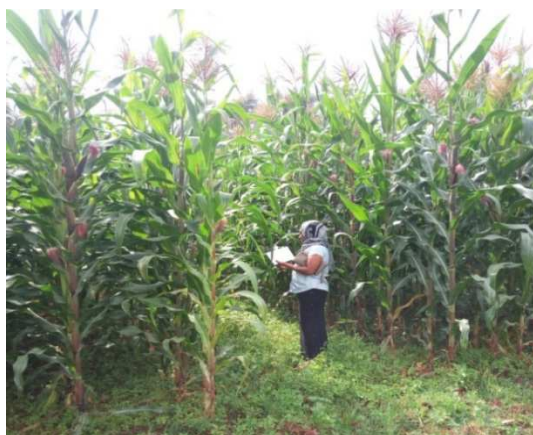
Figure 6. Silking and tasseling stage of maize.