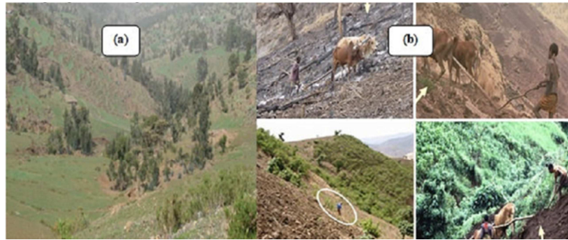
Figure 1. Causes of land-use change: Steep slopes used for cultivation, making the soil susceptible to erosion/degradation [11].