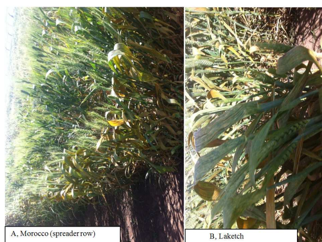
Figure 3. Spreader (Morocco) and severely attacked wheat variety at Meraro.

The following figure 3 indicates that the performance of susceptible wheat lines and how severely attacked spreader to increase the inoculum to the testing materials at meraro station.