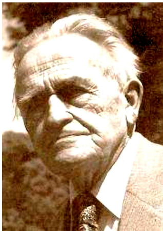
Figure 4. Baron Alexander Von Bernus.

The potency and quality of a natural herbal product thus depends upon harvesting its ingredients at the optimal time.