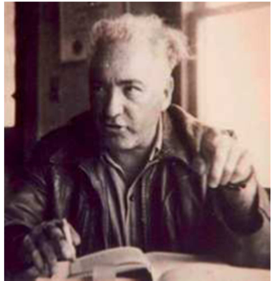
Figure 1. Wilhelm Reich.

The science of biomagnetism refers to the measurement of magnetic fields produced by living organisms. These tiny magnetic fields are produced by naturally occurring electric currents resulting from muscle contraction, or signal transmission in the nervous system, or by the magnetization of biological tissue.