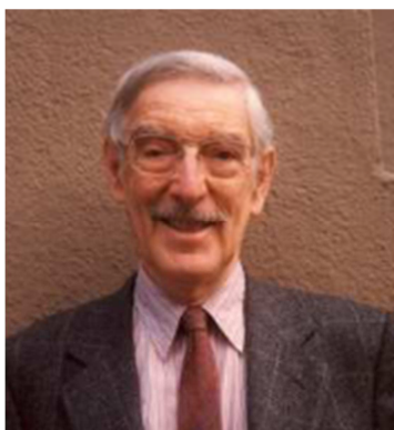
Figure 5. Bruce Ames.

These remedies are all extracted from plants, having energetic properties. They produce energy in the body, its action is gentle and sometimes instantaneous, but more generally gradual and of such a nature that the results can only be perceived after some minutes. They correct the deficiency or the excess to natural proportions and recover the disease speedily, gently, completely and permanently. They do not simply cure the particular disease for which they are prescribed, but at the same time better the constitution of the patients who use them.