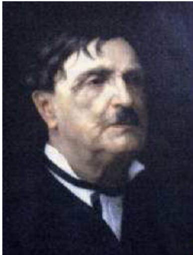
Figure 6. Grafen Cesare Mattei.

endings), and Color therapy (as evident from his writings on electric color fluids) and Biochemic tissue salt therapy (Cell theory of Virchow (1858): the body is a collection of cells and that all medical treatment should center on the health of the individual cell). Together with German biochemist, William H. Schuessler, in 1873, they developed Biochemic system of medicine based on cellular health).