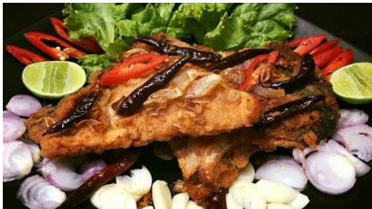
Figure 4 Food from pickled fish (Pla Som in Thai).