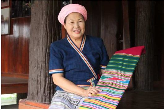
Figure 3. Tai Lue Culture.