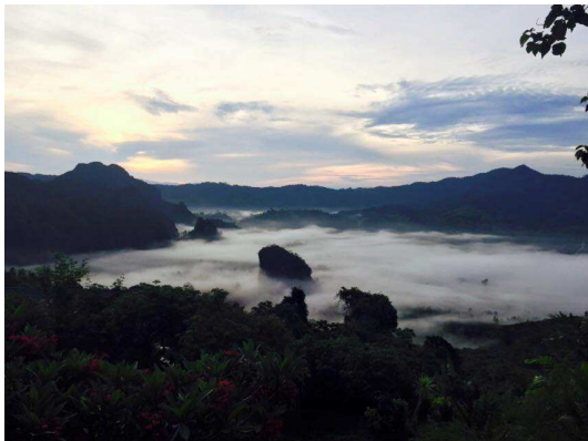
Figure 5. Phu Langka, Phayao.